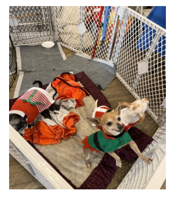
PAWsitive Difference Pet Adoption brought some puppies to celebrate the day and possibly be adopted