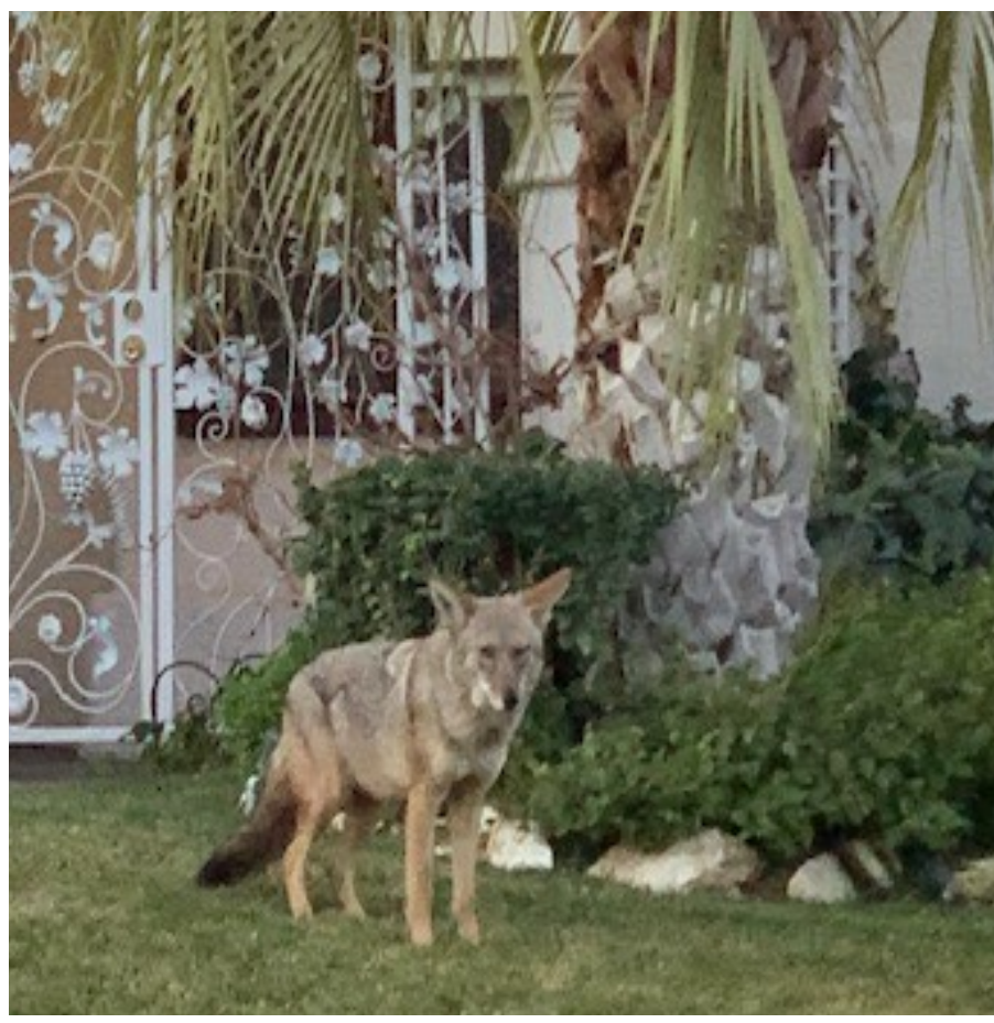
Coyote pictured here was taken during the day inside the community

A person shall not intentionally keep, harbor or in any way care for, maintain, lodge or feed on private property, a bat, skunk, raccoon, fox or coyote - NAC 441A.445. Clean up pet food after feeding domestic animals and discard food waste in the garbage and not on the ground or in the desert. Keep in mind that if you are feeding other wildlife — ducks, birds,