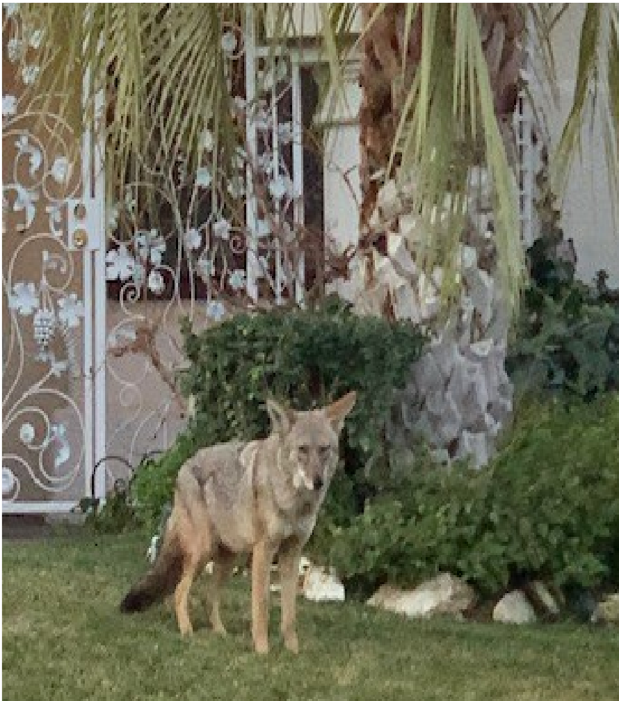
Coyote pictured here was taken during the day inside the community

A person shall not intentionally keep, harbor or in any way care for, maintain, lodge or feed on private property, a bat, skunk, raccoon, fox or coyote - NAC 441A.445. Clean up pet food after feeding domestic animals and discard food waste in the garbage and not on the ground or in the desert. Keep in mind that if you are feeding other wildlife— ducks, birds, rabbits, etc.—you are feeding coyotes.